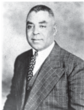
Oscar McKinley Charleston