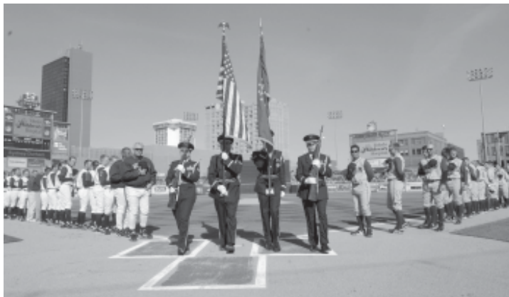
Opening Day - April 13, 2007 (Toledo - Durham)

Modern-Era Record on Opening Day: 21-22 Opening Day Record at FifthThird Field: 4-2 Longest Winning Streak: 5 Games (1979-1983) Longest Losing Streak: 5 Games (1998-2002) Opening Day Record, Extra Inning Games: 4-2 Longest Game, Innings: 14 innings (4/6/95 vs. Pawtucket) won 4-3 Largest Margin of Victory: 10 (4/16/76 at Memphis) won 11-1 Largest Margin of Defeat: 9 (4/13/73 at Tidewater) lost 11-2 Most Runs/Game, Both Teams: 17 (4/3/1997 vs. Ottawa) won 9-8